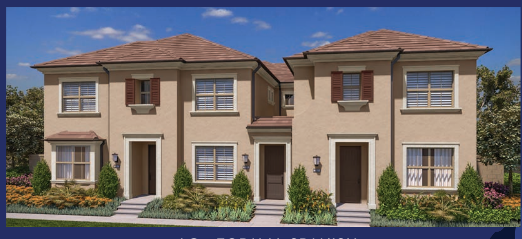
AC – FORMAL SPANISH