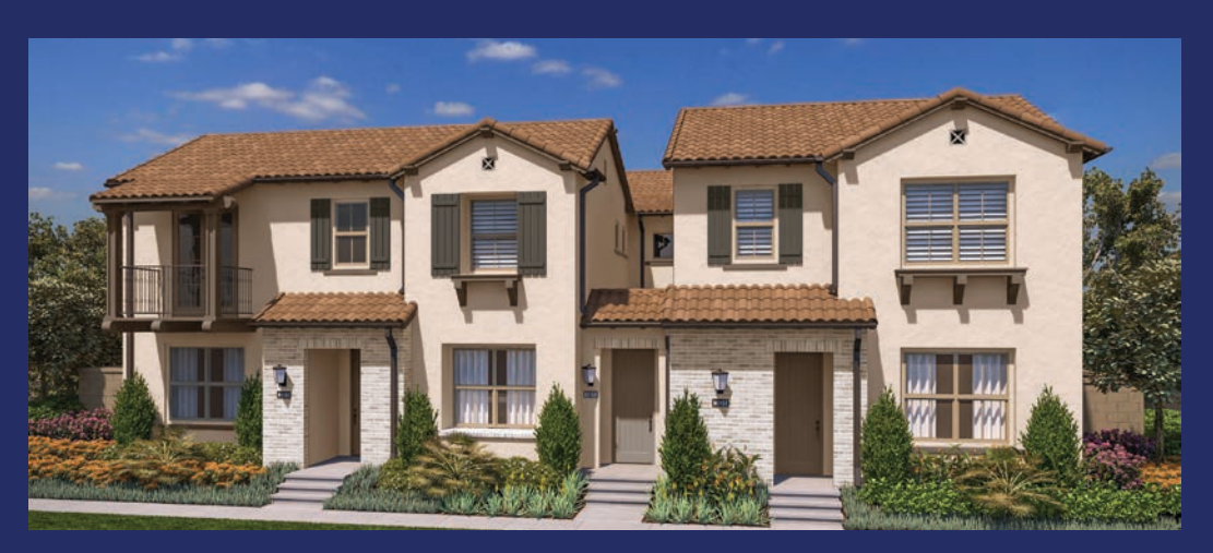
— AB – SPANISH MONTEREY –